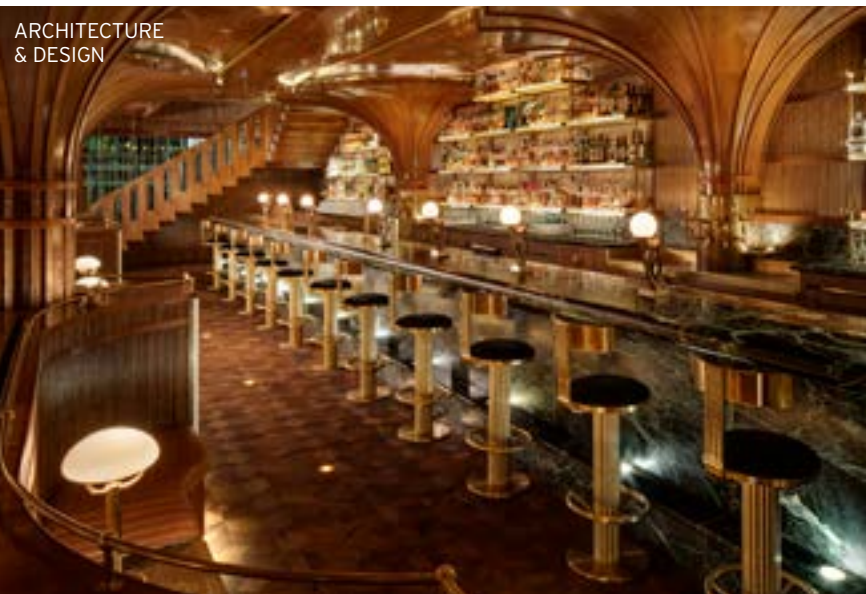
ARCHITECTURE & DESIGN